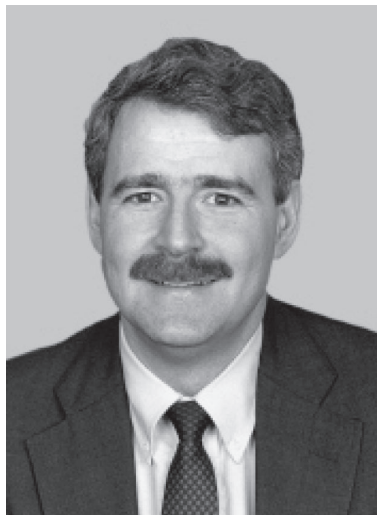
Mayor Tom Barrett

The Sewer Socialists were known for their efforts to clean up Milwaukee and right some of the wrongs of the Industrial Revolution. Education was expanded, sanitation systems were implemented, and many new regulations were imposed to prevent the corruption and abuse that ran rampant in previous years. Socialists controlled Milwaukee for a total of 38 years, from 1910-1912, then again from 1916-1940, and finally from 1948-1960. The party fell from power and prominence due to the onset of the Cold War and the rise of the “red scare.”