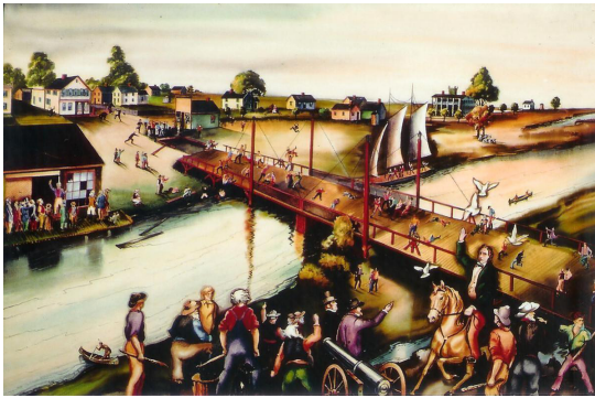
Milwaukee Bridge War

did not line up with those in Juneautown.