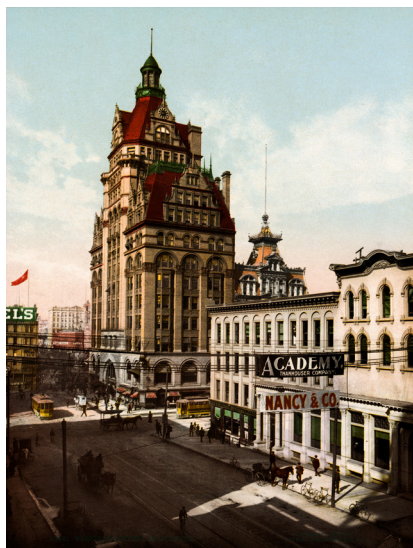
Wisconsin Street, Milwaukee, 1900

Following the decline of the Sewer Socialists, the Democratic Party has governed Milwaukee from 1960 onward. Currently, the city is governed by Mayor Tom Barrett. During his tenure as Mayor of Milwaukee, Barrett has practiced responsible budgeting, cutting spending by $30 million after the recent financial crisis threatened the city's pensions. He has also dramatically reduced the city's crime rate, improved Milwaukee's public school system, and worked to create green jobs in the city.