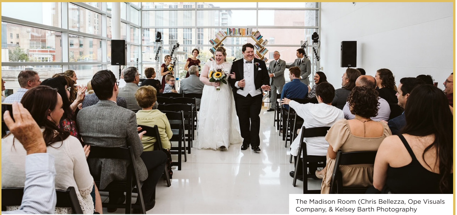
The Madison Room