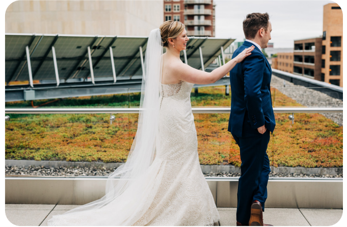
Patio