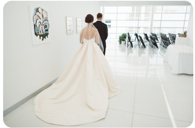
Art Gallery (Ope Visuals Company)