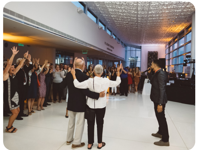
Madison Room